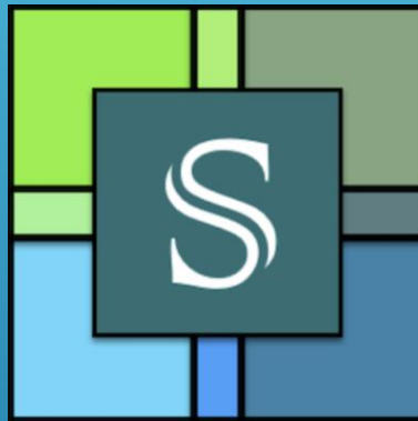
The Soto Law Office, P.A.